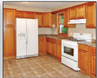
NSP home in Coon Rapids before and after rehab.