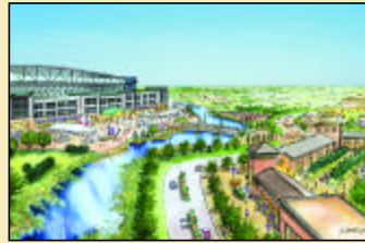
Artist rendering of the proposed Vikings stadium (at left) and surrounding development in Blaine.