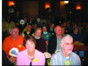
Supporters rallied at the state capitol in February in support of Northstar commuter rail.